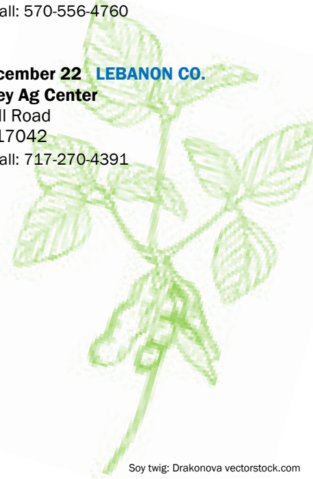
Soy twig

Thursday, December 22 LEBANON CO. Lebanon Valley Ag Center 2120 Cornwall Road Lebanon, PA 17042 For questions call: 717-270-4391