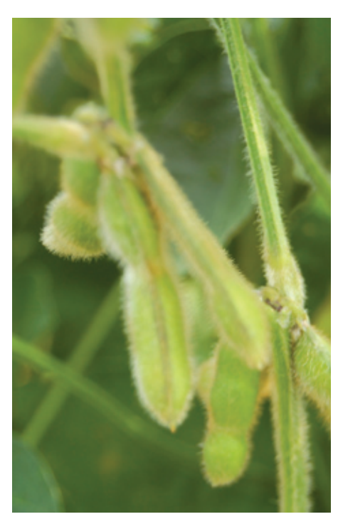
The results of university-conducted variety trials give farmers a valuable tool to help them evaluate and choose the best variety to plant on their farms.