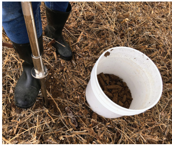
The best time to test for SCN in your soils is right before or at harvest. Testing by Penn State's Department of Plant Pathology and Environmental Microbiology is free.

Soil sampling for nematodes requires collecting 1-inch-diameter soil cores to a depth of 6-8 inches. When a soil probe is unavailable, use a shovel or a hand trowel to take the sample.