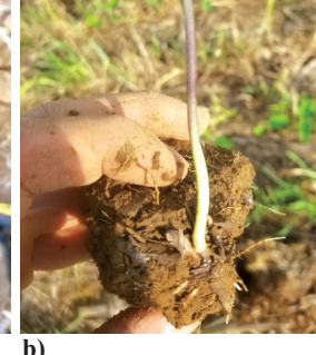
Root ball samples at a). unrolled unifoliolate leaves (VC), and b). first trifoliolate (V1) growth stage collected from Ilevo field in Lebanon and Centre Counties, respectively.

plot was recorded, and 15 plants per plot were collected for destructive measurements. The collected plants were evaluated in the lab for any disease incidence. At harvest, the yield from each plot will be collected separately for yield comparison between the two treatments.