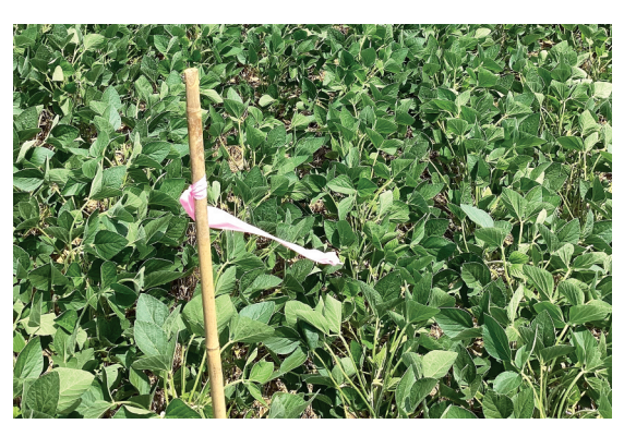
An Ilevo-treated plot in a Lebanon County field at the R2 growth stage.

For the microbiome portion of this study, sampling of root ball samples was carried out at emergence (VE), unrolled unifoliolate leaves (VC), and first trifoliolate (V1) growth stages. Sampling was done for Ilevo-treated and control plots within a selected block. The goal of taking these three samples was to determine if there are any detectable changes in the soil microbial profile and composition due to the Ilevo seed treatment.