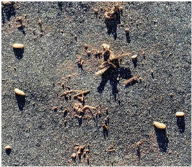
Slug monitoring shingle trap.

Since 2018, Extension Educators across Pennsylvania have assessed slug populations and crop damage each week at 20 to 30 sites. Each site is a problem slug field identified by the farmer cooperator. Educators scout for slug eggs in each field