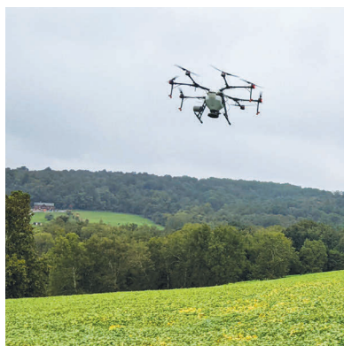
Drone seeding black oats and hairy vetch into standing soybeans at a Lancaster County cooperator site.