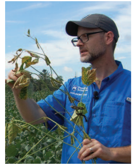
Dr. Paul Esker

For fields where white mold has been noted, it's very important to measure the incidence of white mold at maturity (growth state R7). This assessment will help quantify the potential yield loss due to white mold. Disease incidence can be estimated by examining different areas