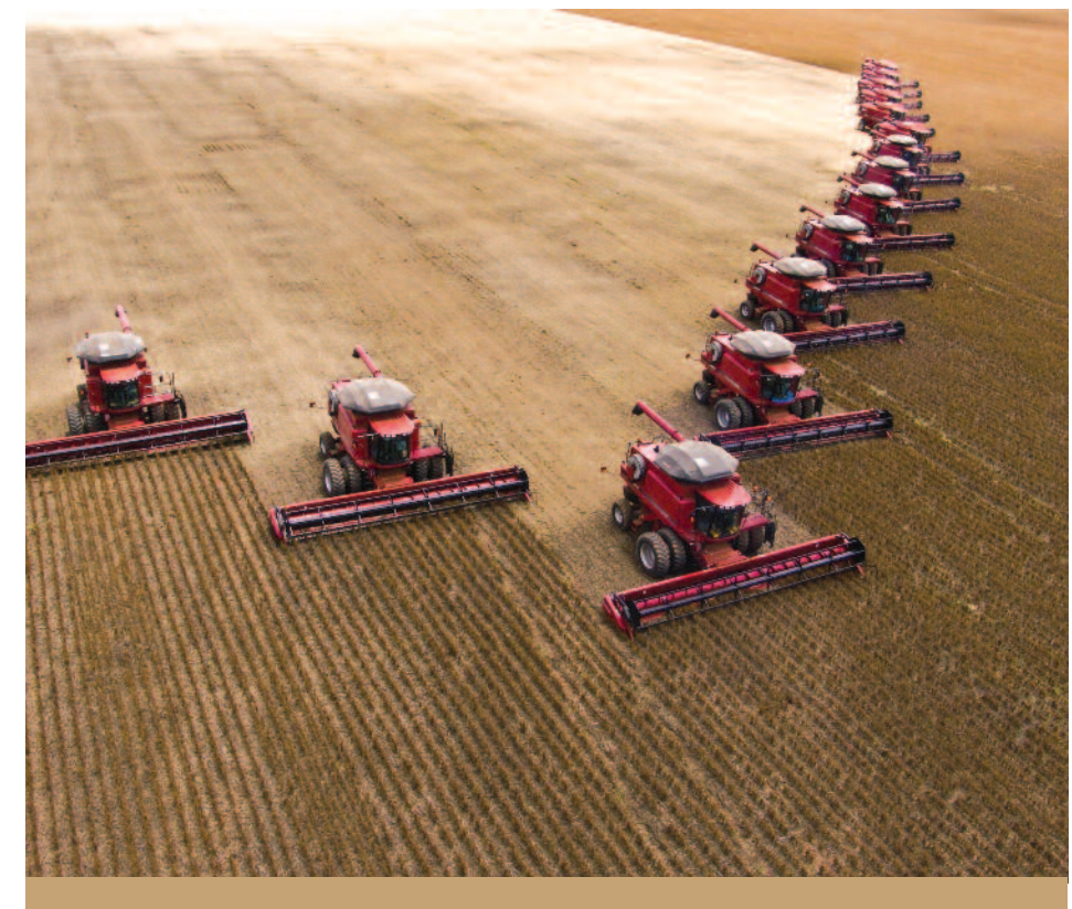
Soybean harvest in Mato Grosso, Brazil.

During the next few days, the group will also get a first-hand look at a number of Brazil's leading innovative farms, two cooperatives, and three research facilities in Parana and Rio Grande do Sul. These farms include some noted no-till innovators as well as the soybean record holder in Brazil, a farm that has won the national soybean yield contest two times, and currently holds the national soybean yield record (133 bu./acre) without irrigation.